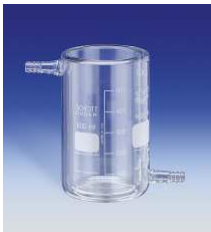
Tempering beaker type T