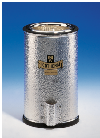
Dewar flask FB 9 CAL without viewing stripes