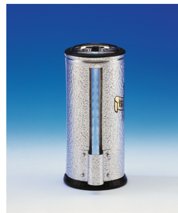
Dewar flask FB 9 CAL with viewing stripes